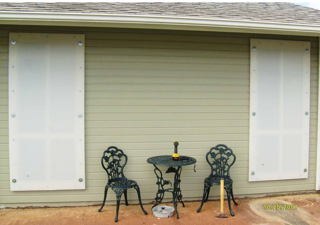
Hurricane Protection Services provides window storm panels and other devices to help protect your home.