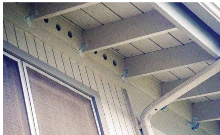
Roof-to-wall hurricane clips can help your roof stay put in a storm.

HPS is a member of HLPAA (Hawaii Lumber Products Association) and the BIA-Hawaii (Building Industry Association of Hawaii) and has been doing volunteer legislative lobbying work for home and condo owners and the building industry on Disaster Preparedness and Loss Mitigation issues for 13 years. For more information, call 847-4400, E-mail hpp@aloha.net or visit hurricaneprotect.com .